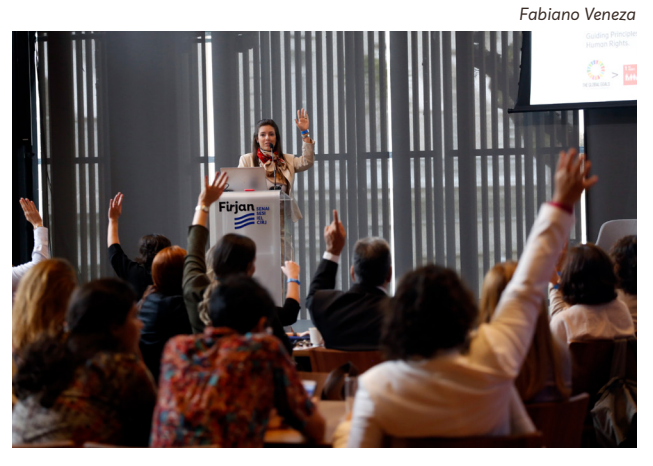
Workshop on Sustainability Criteria in the Value Chain brought together more than 80 participants in 2019 at Casa Firjan.

Other initiatives were carried out between 2018 and 2020 on the most varied sustainability issues, such as: the meetings series on Environmental Obligations of Industry, in partnership with environmental agencies; the Workshop on Sustainability Criteria in the Value Chain, supported by the European Union; the 2019 WEPs Forum, co-organized with UN Women; and the 2020 Industry and Environment webinar series, our first virtual effort in the context of the COVID-19 pandemic. The reach of these initiatives was more than 4,000 face-to-face participants and 6,500 virtual accesses until the closing of this report.