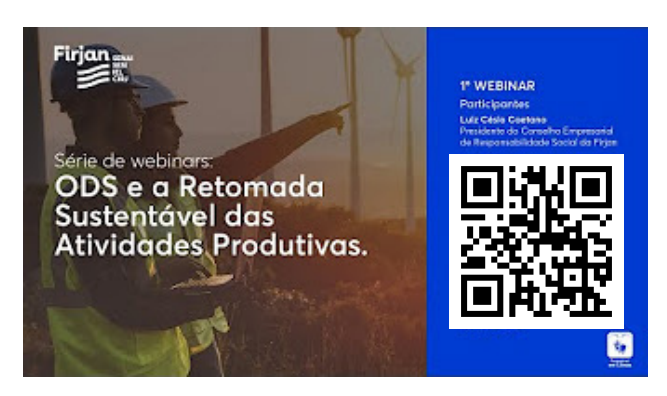
Webinar Series | SDGs and the sustainable resumption of productive activities. Click and access the series playlist.