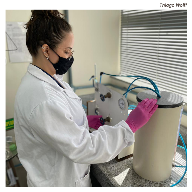
Technician works in the ultrafiltration project for water purification.