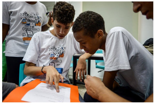
Porto do Saber Project

with the human development matrix as the driver of actions.