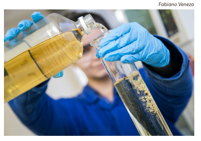
Development stage of the filtration system based on renewable material for the treatment of oily water.