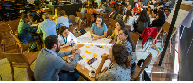
Oasis Lab workshop for co-creating Nature-based Solutions, held in 2019 at Casa Firjan.