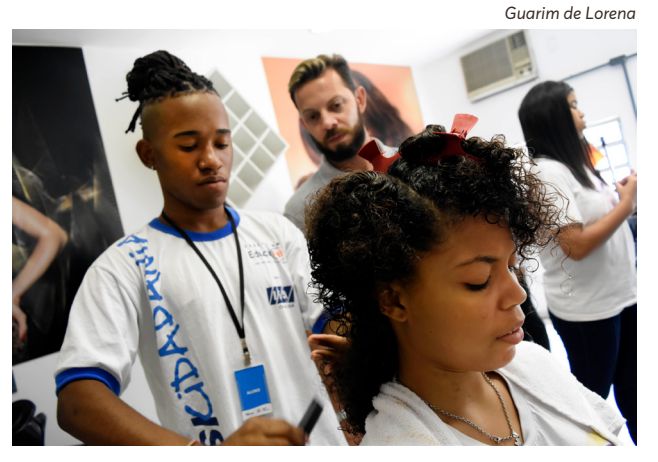
Final class of the 2018 Beauty Course of the SESI Cidadania Program.

With this, we strengthen the social role within the territories and in front of its target audience. From 2018 to 2020, the Program reached around 453,000 attendees and two important awards. In December 2018, it won the SDG Brasil Award, being among the 10 best practices in the non-profit private company category and in Decem-