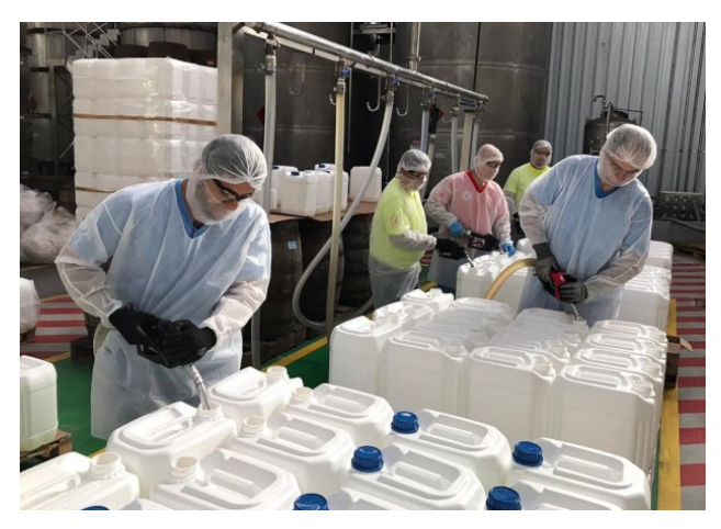
Bottling of alcohol gel for donation to the public health network in Rio de Janeiro.

new challenges, such as the reconstruction of production chains, and debating on the impact for companies and professionals and ways to survive the crisis;