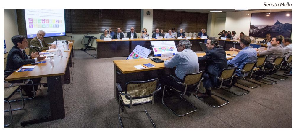
Joint meeting to close the 2018 activities of the Environment and Social Responsibility Councils.

It is worth mentioning that since 2018, the Social Responsibility and the Environmental Business Councils have held joint meetings dedicated exclusively to the SDGs. In these meetings, always held at the last meeting of the year, we count on the partnership of Global Compact Network Brazil and invite companies and organizations of reference for their work with the SDGs in order to discuss progress in achieving the goals and point out prospects for future actions.